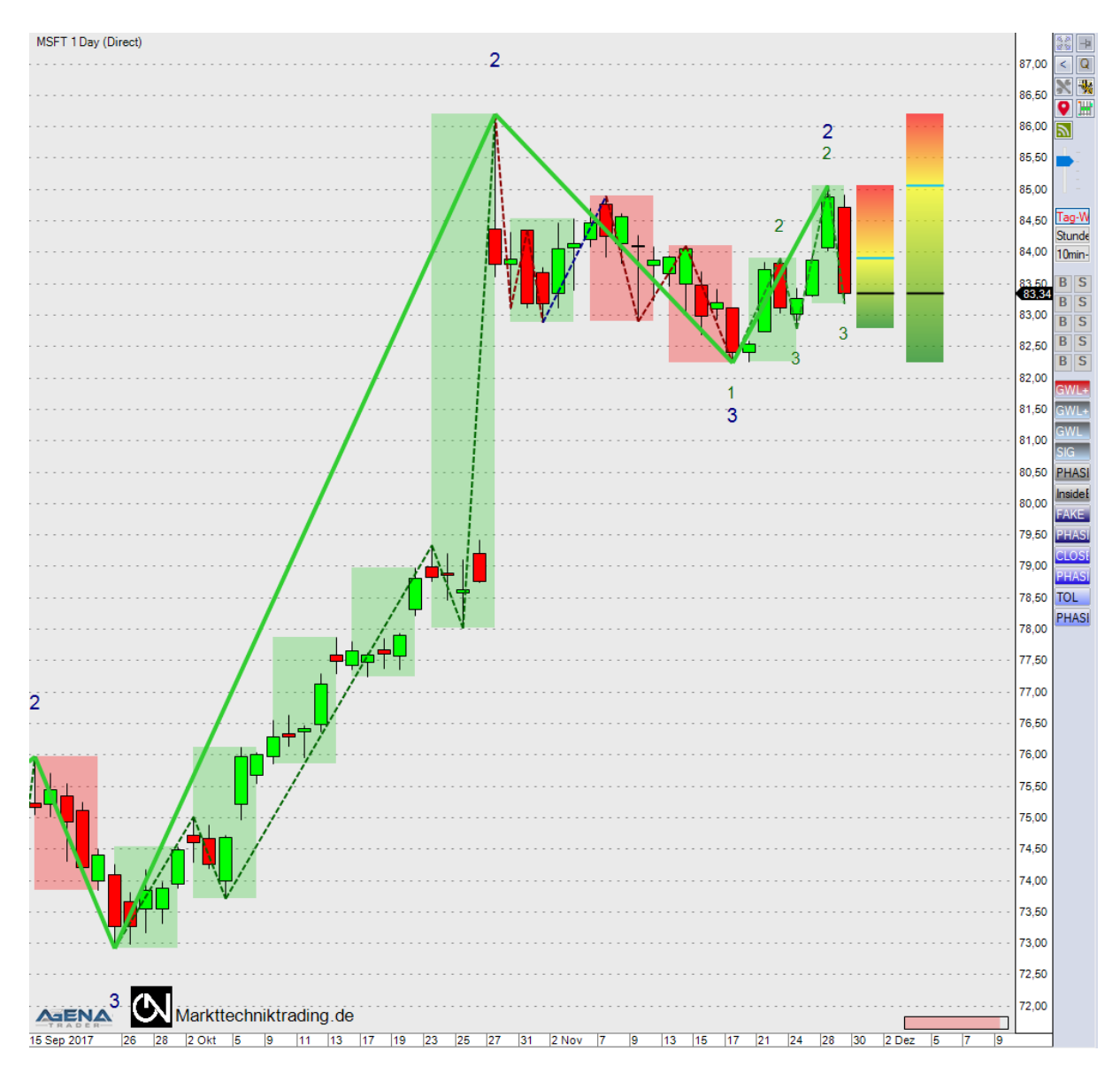
Figure 2 – ON123Pro Indicator